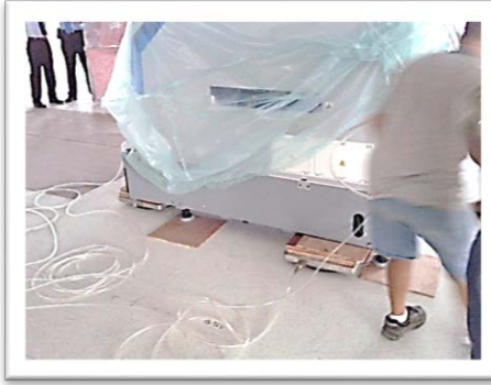
Machine positioning using a safety air pump