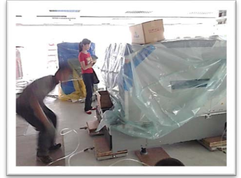
Vacuum bag packaging